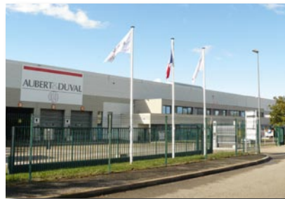
FRANCE - Lyon