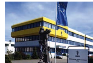
GERMANY - Mönchengladbach