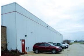
USA - Chicago