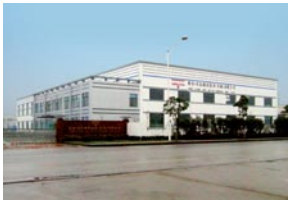
CHINA - Wuxi