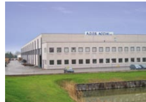
ITALY - Ferrara